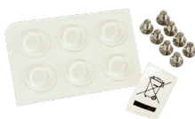
Screw and feet kit