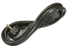
2x IEC cords